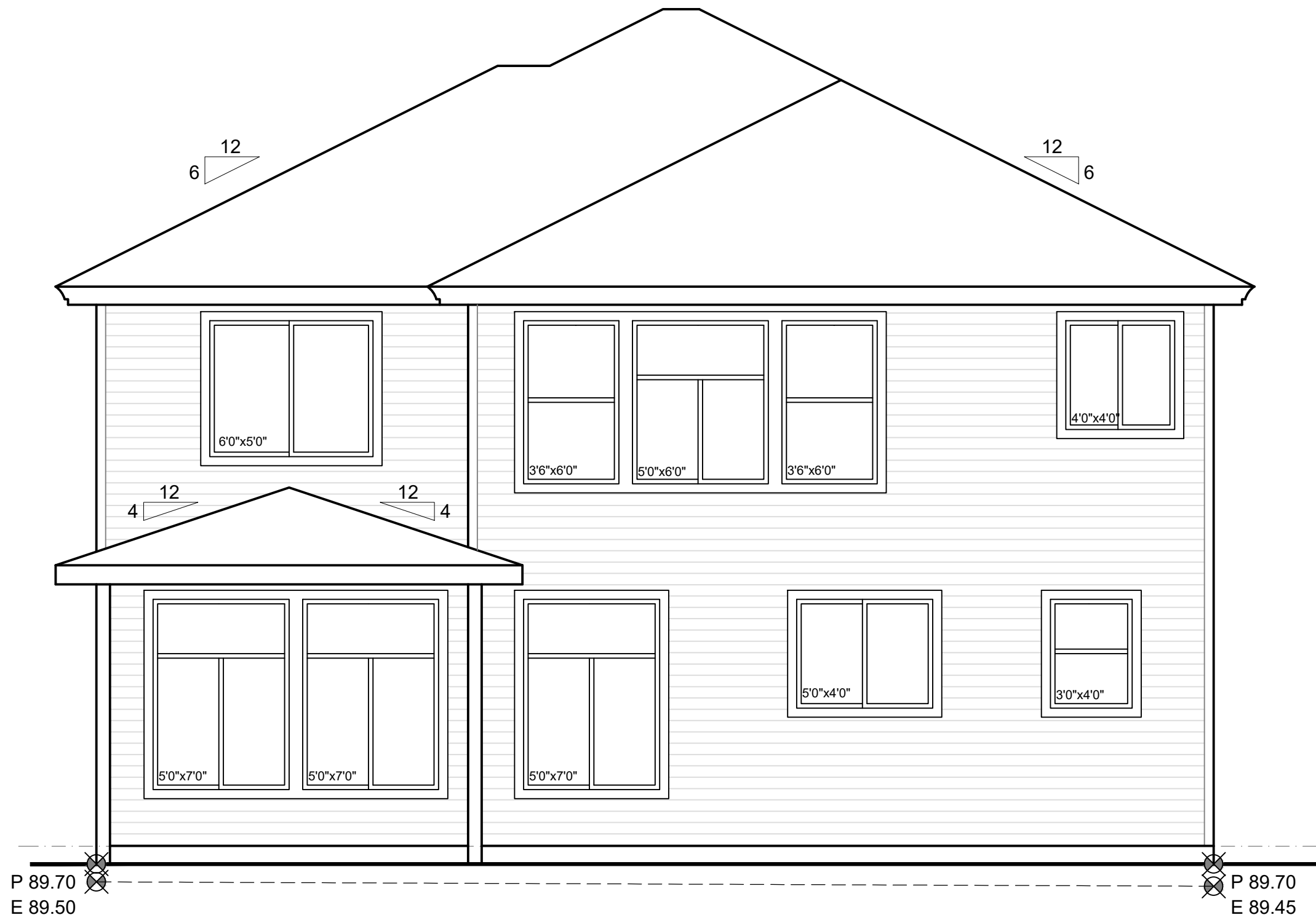
1 REAR ELEVATION (SOUTH) Scale: 1/4"=1'-0"