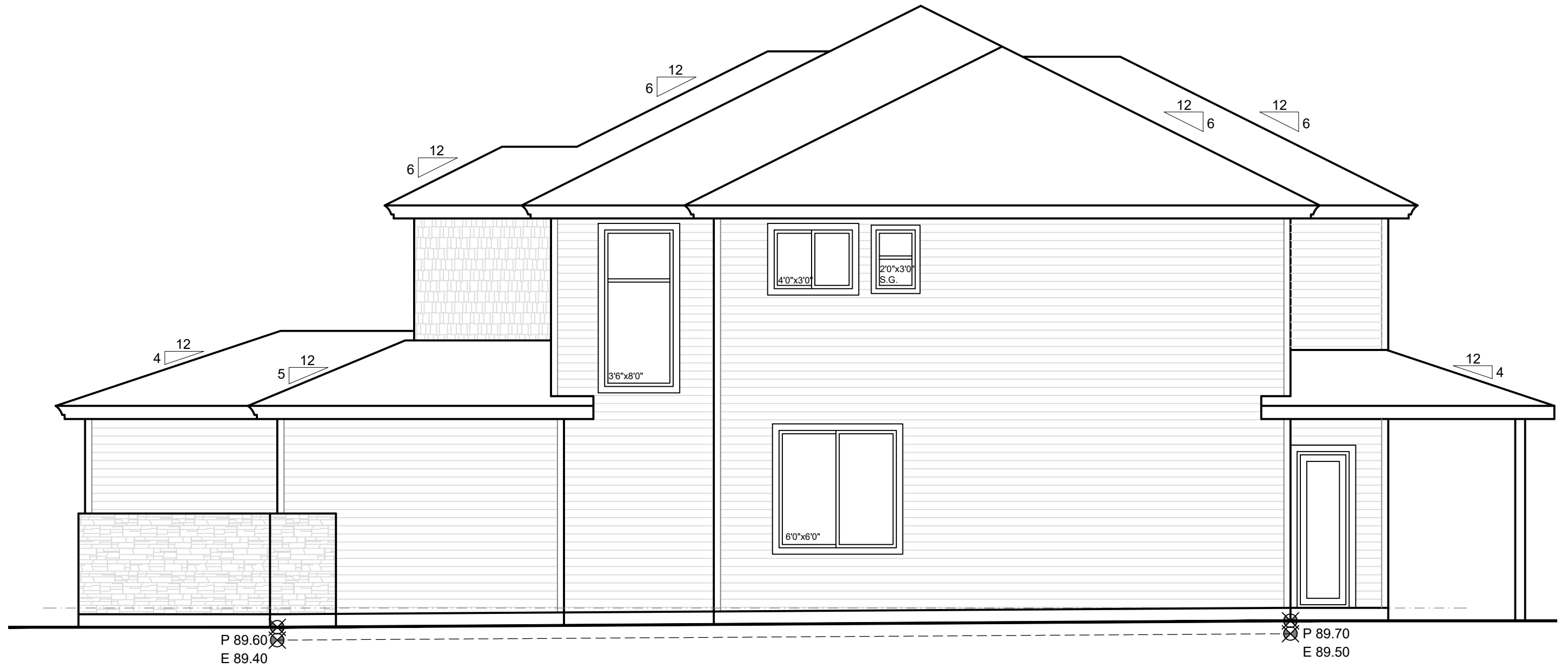
2 RIGHT ELEVATION (WEST) Scale: 1/4"=1'-0"