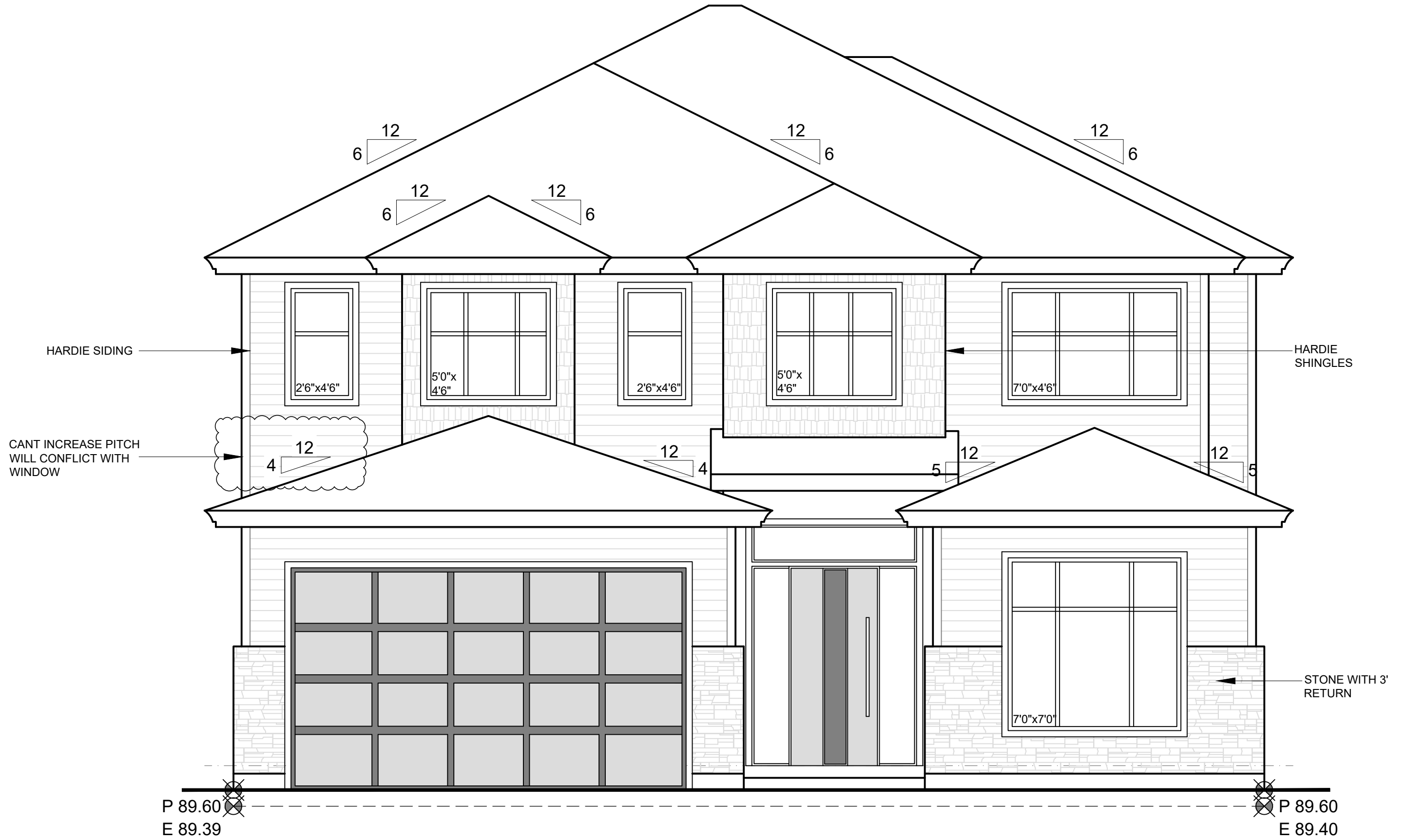
1 FRONT ELEVATION (NORTH) 18A AVENUE Scale: 1/4"=1'-0"